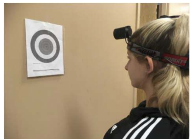
Fig. 1. The joint position error test.

Cervical joint mechanoreceptors have been identified as playing a role in upright posture (Armstrong and McNair, 2008; Brandt,