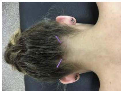
Fig. 2. Needle placement to target the OCI.