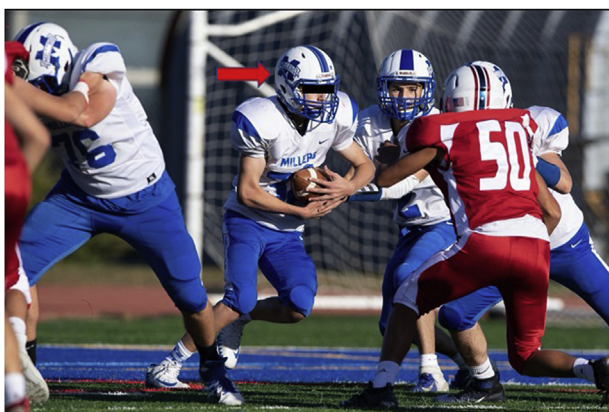
Fig. 3. Patient playing competitive football 3.5 years after traumatic injury with symptoms consistent with SCIWORA. Note: the patient's family consented to all images included in this case report.

Other investigators have also proposed that SMT activates joint mechanoreceptors, spinal ligaments, intervertebral discs, cutaneous receptors, golgi tendon organs, and muscles spindles, which collectively work to inhibit alpha motor neuron excitability so as to correct muscle hypertonicity (Colloca et al., 2004; Pickar and Kang, 2006; Symons et al., 2000). A number of studies have specifically measured decreased paraspinal activity post SMT during movement (Bicalho et al., 2010; Tunnell, 2009) and at rest (DeVocht et al., 2005; Lehman et al., 2001; Orakifar et al., 2012). Dunning and Rushton further reported a significant decrease in the tone of the bilateral biceps brachii, a muscle segmentally and neuroanatomically associated with, but not attached to the spine, following a single manipulation targeting the right C5–C6 compared to control (Dunning and Rushton, 2009).